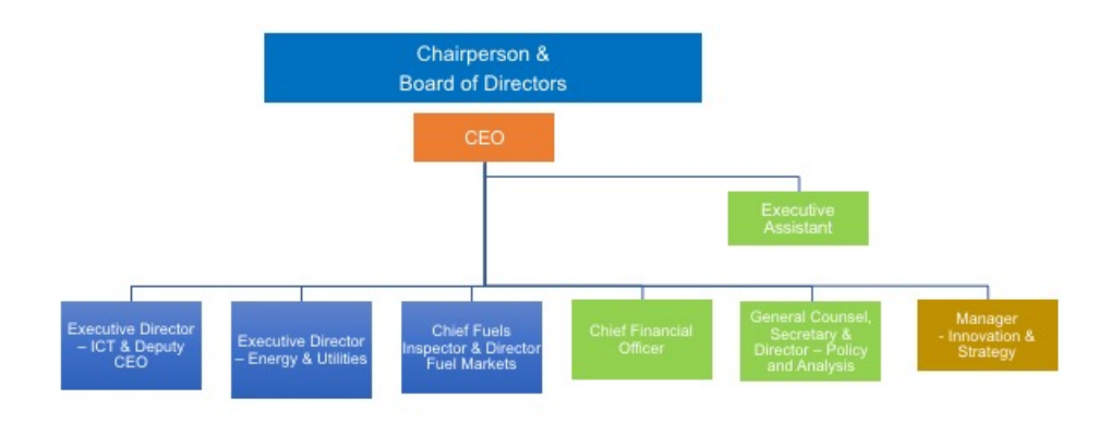
Figure 2: Current Organisational Structure

56. The Office has been operating since January 2017 within the organisational structure shown in Figure 2 below.