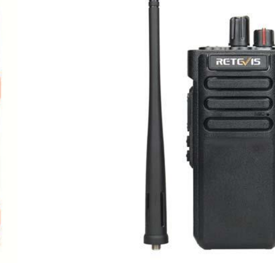
Example of a radio with an integrated antenna.