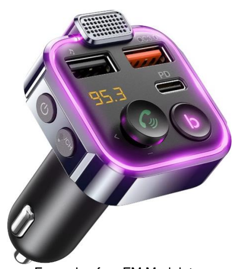
Example of an FM Modulator

71. Ultra-low power FM transmitters (also called 'FM Modulators') are typically used in vehicles which do not have Bluetooth built-in as a means of playing sound from a mobile device through a vehicle's loudspeakers. They operate as low power FM radio transmitters and the in-built car radio is tuned to their output frequency. They can be used to play music from a phone, or to use the vehicle's speakers as a hands-free extension.